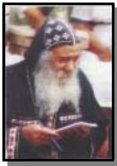
His Holiness Pope Shenouda III

We will study fasting from the dogmatic point of view (not spiritually).